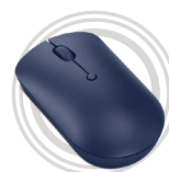
Lenovo 540 USB-C Wireless Mouse