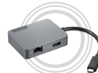
Lenovo USB-C Travel Hub Gen 2