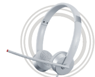
Lenovo 110 Stereo USB Headset