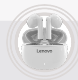
Lenovo E310 True Wireless Stereo Earbuds