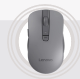
Lenovo WL310 Bluetooth Silent Mouse