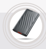
Lenovo PS6 Portable SSD