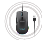
Lenovo M210 RGB Gaming Mouse