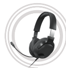
Lenovo Ideapad Gaming H100 Headset