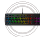
Lenovo Legion K310 RGB Gaming keyboard