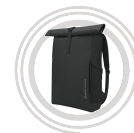
Lenovo IdeaPad Gaming Modern Backpack