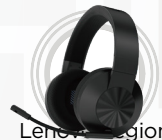
Lenovo Legion H600 Wireless Gaming Headset