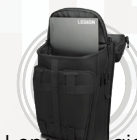
Lenovo Legion Active Gaming Backpack

service covers accidents beyond the system warranty and protects your devices from non-warranty operational or structural failures incurred under normal operating conditions.