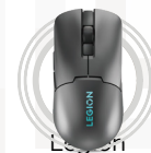
Lenovo M600s Qi Wireless Gaming Mouse