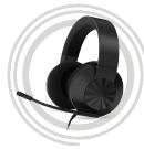
Legion H200 Gaming Headset