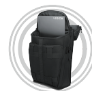
Lenovo Legion Active Gaming Backpack