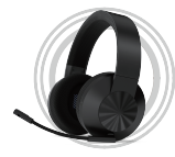
Lenovo Legion H600 Wireless Gaming Headset