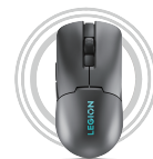
Legion M600s Qi Wireless Gaming Mouse