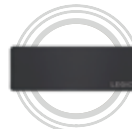
Legion Gaming Cloth Mouse Pad XL

* Example of Lenovo marketing catalogue naming convention