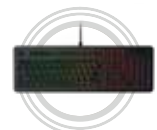
Legion K310 RGB Gaming Keyboard