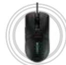
Legion M300s RGB Gaming Mouse