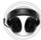
Legion H200 Gaming Headset