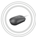
Lenovo 540 USB-C Wired Mouse