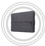
Lenovo Urban Sleeve 14"