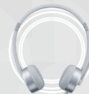
Lenovo 100 Stereo Analog Headset