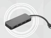
Lenovo USB-C to 4 USB-A Hub