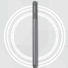
Lenovo USI Pen 2

* Example of Lenovo catalogue naming convention