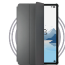
Lenovo Tab P12 Folio Case