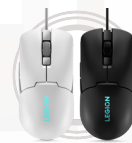
Lenovo Legion M300s RGB Gaming Mouse