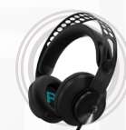
Lenovo Legion H300 Stereo Gaming Headset