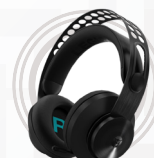
Legion H300 Stereo Gaming Headset