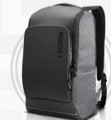
Lenovo Legion 15.6" Recon Gaming Backpack

* Example of Lenovo catalogue naming convention