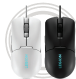
Lenovo Legion M300s RGB Gaming Mouse