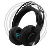
Lenovo Legion H300 Stereo Gaming Headset