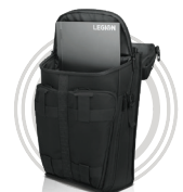
Lenovo Legion Active Gaming Backpack