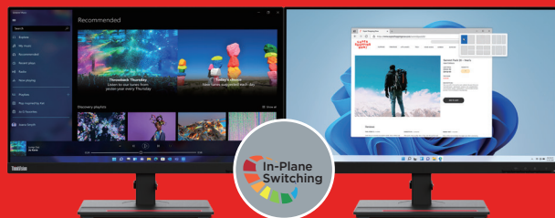
Multitask with multi-monitor assembly through Daisy-chaining.