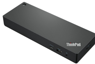
ThinkPad® Workstation Thunderbolt™ 4 Dock