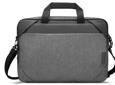
Lenovo Business Casual 15.6-inch Topload