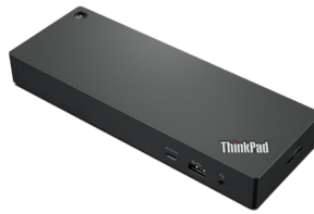
ThinkPad Universal Thunderbolt™ 4 Dock