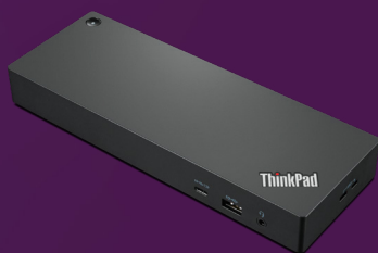
ThinkPad Workstation Thunderbolt™ 4 Dock