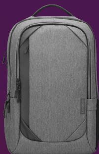
Lenovo Business Casual 17-inch Back

For a full list of accessories and options, please visit: accsmartfind.lenovo.com