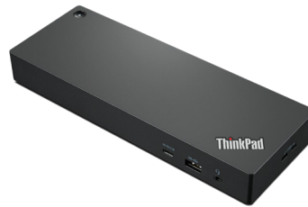
ThinkPad® Workstation Thunderbolt™ 4 Dock