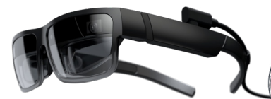
ThinkReality® A3 XR1 3G+32G