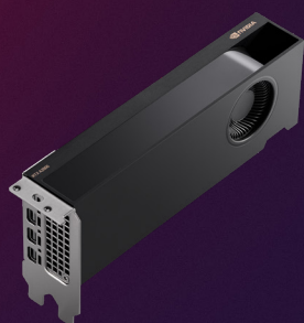
NVIDIA RTX™ A2000 Graphics Card

For a full list of accessories and options, please visit: accsmartfind.lenovo.com