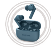
Lenovo TWS YOGA PC Edition