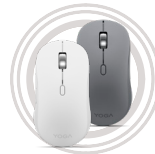
Lenovo Yoga Bluetooth Silent Mouse