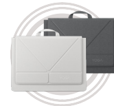
Lenovo Yoga Tote Sleeve