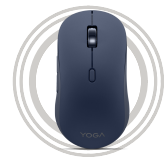
Lenovo Yoga Bluetooth Silent Mouse

* Full headphone functionality requires upcoming software update in Oct 2024. Product images may differ from the latest design.