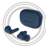
Lenovo TWS YOGA PC Edition