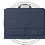
Lenovo Yoga Tote Sleeve