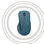
Lenovo Slim Mouse