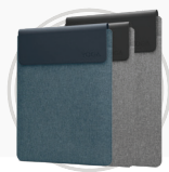
Lenovo Yoga Sleeve (14.5" and 16")

* Example of Lenovo catalogue naming convention