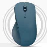
Lenovo Yoga Pro Mouse