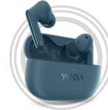
Lenovo Yoga True Wireless Stereo Earbuds