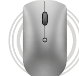
Lenovo 600 Silent Mouse Bluetooth® (optional)