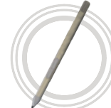
Lenovo Slim Pen (included)