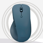
Lenovo Yoga Pro Mouse