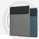
Lenovo Yoga Sleeves