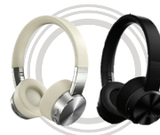
Lenovo Yoga Active Noise Cancellation Headphones