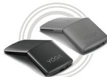
Lenovo Yoga Mouse with Laser Presenter