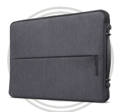
Lenovo Urban Sleeve Case