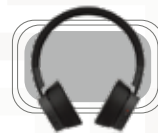
Lenovo Yoga Active Noise Cancellation Headphones