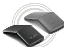
Lenovo Yoga Mouse with Laser Presenter