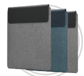
Lenovo Yoga Sleeve