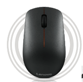
Lenovo 400 Wireless Mouse